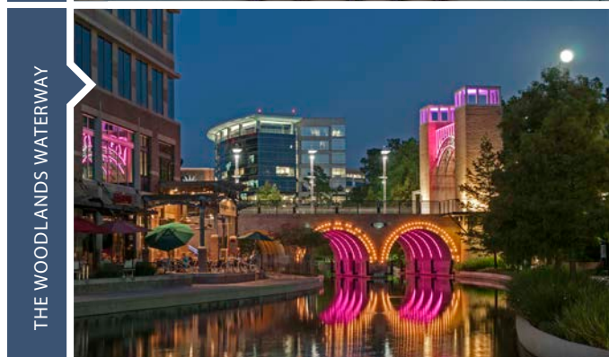
THE WOODLANDS WATERWAY