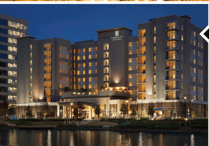
EMBASSY SUITES BY HILTON