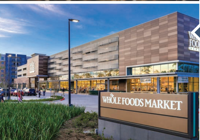
WHOLE FOODS MARKET®