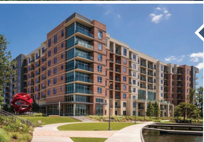
ONE LAKES EDGE