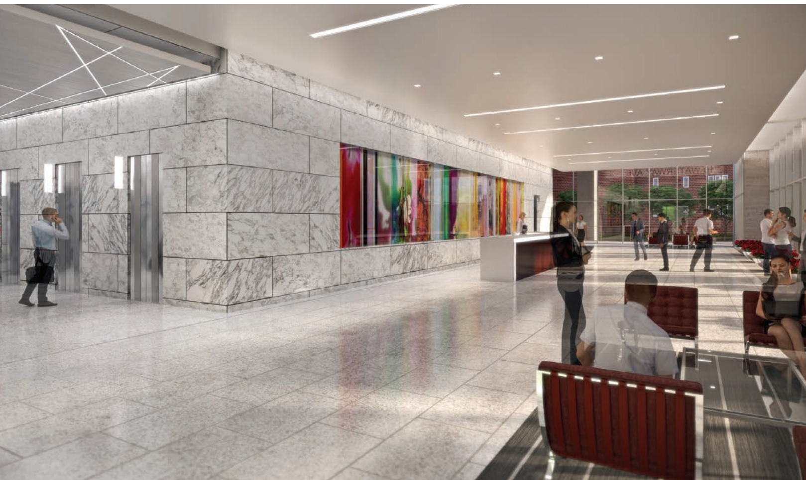
THE WESTIN AT THE WOODLANDS