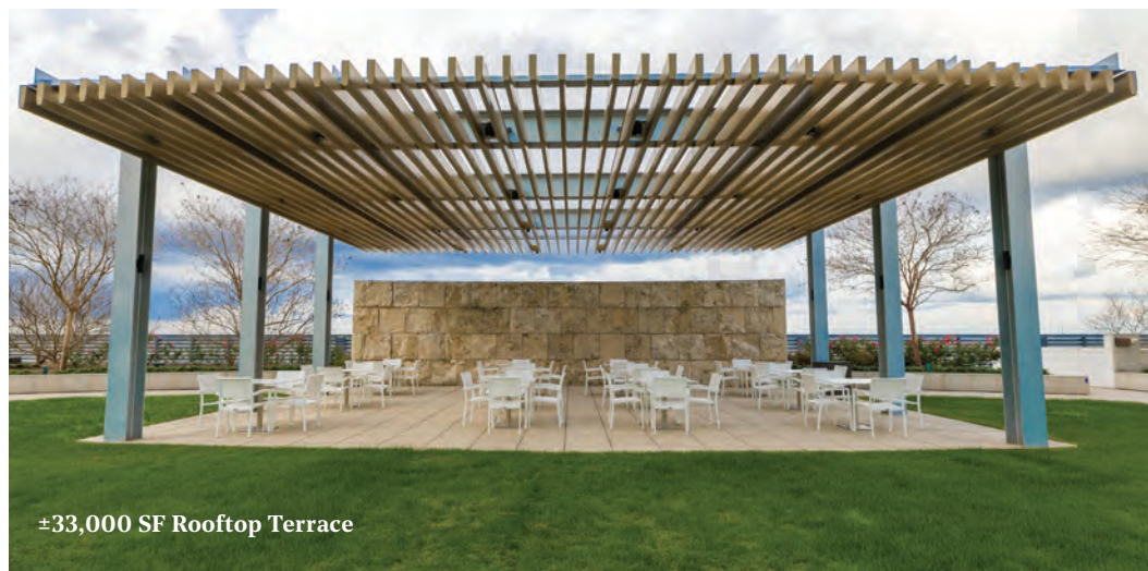
±33,000 SF Rooftop Terrace