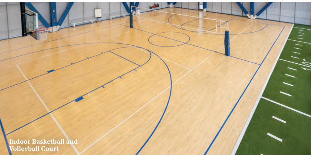
Indoor Basketball and Volleyball Court