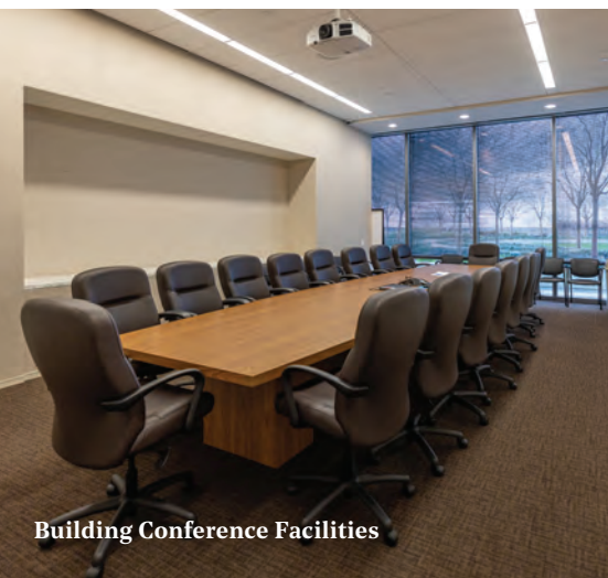
Building Conference Facilities