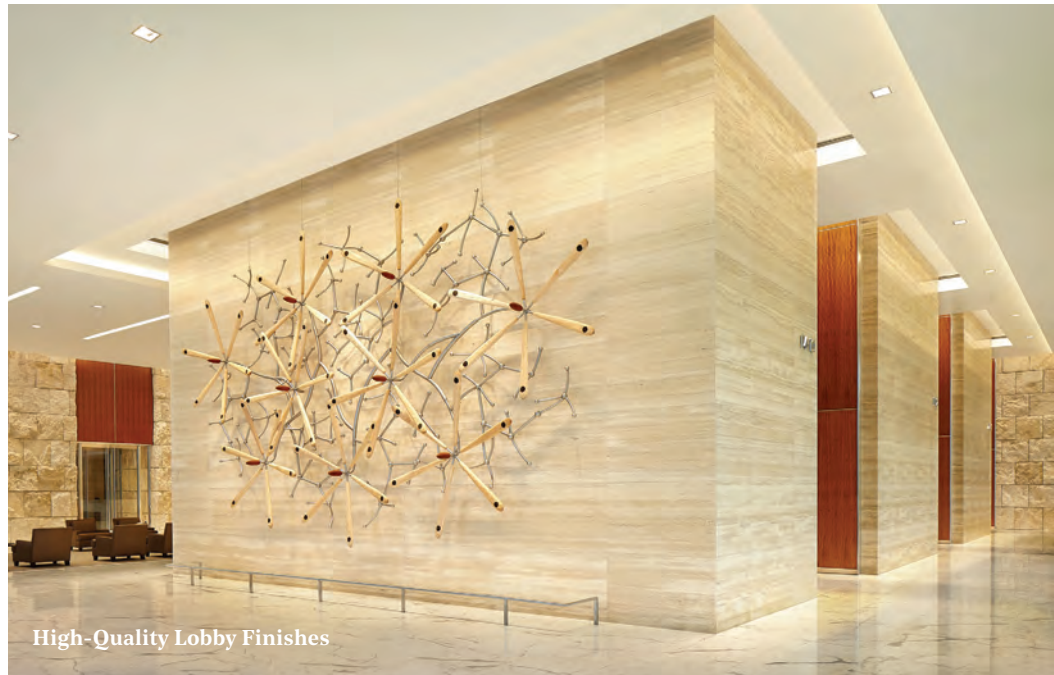
High-Quality Lobby Finishes